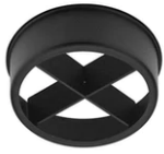
Screening crosspiece 08.8429.00