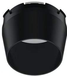
Snoot Shielding Cone 08.9111.00