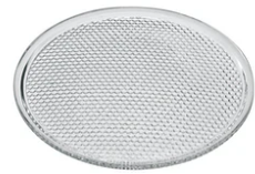
Flood Lens 08.9110.00