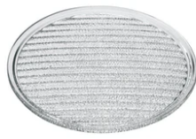
Elliptical Lens 08.9109.00