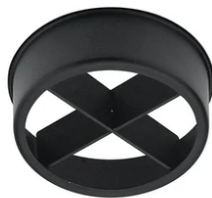
Screening Crosspiece 08.9108.00