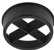
Screening Crosspiece 08.9108.00