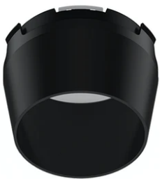
Snoot Shielding Cone 08.9111.00