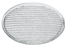
Elliptical Lens 08.9109.00