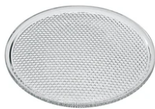
Flood Lens 08.9110.00