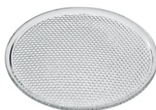
Snoot Shielding Cone 08.9111.00