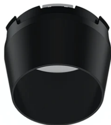
Elliptical Lens 08.9109.00