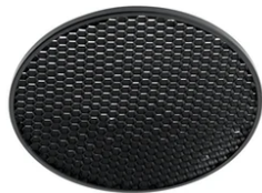
Flood Lens 08.9110.00