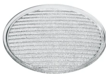
Snoot Shielding Cone 08.9111.00