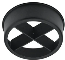
Screening Crosspiece 08.9108.00