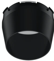
Snoot Shielding Cone 08.9111.00