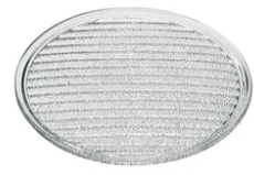
Elliptical Lens 08.9109.00