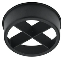
Screening Crosspiece 08.9108.00