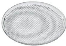
Flood Lens 08.9110.00