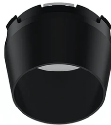
Snoot Shielding Cone 08.9111.00