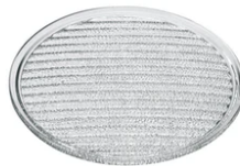
Elliptical Lens 08.9109.00