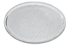
Flood Lens 08.9110.00