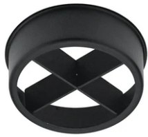
Screening Crosspiece 08.9108.00