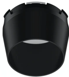
Snoot Shielding Cone 08.9111.00