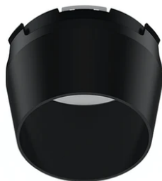
Snoot Shielding Cone 08.9111.00