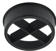
Screening Crosspiece 08.9108.00