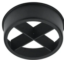
Screening Crosspiece 08.9108.00