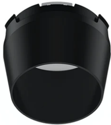
Snoot Shielding Cone 08.9111.00