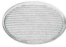
Elliptical Lens 08.9109.00