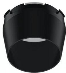
Snoot Shielding Cone 08.9111.00