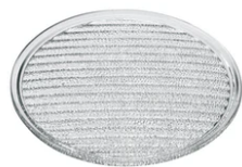
Elliptical Lens 08.9109.00