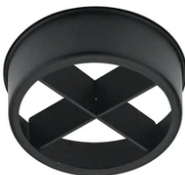
Screening Crosspiece 08.9108.00