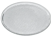
Flood Lens 08.9110.00