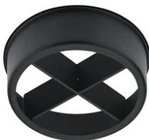
Flood Lens 08.9110.00