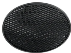
Elliptical Lens 08.9109.00