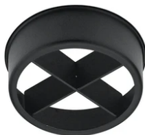
Screening Crosspiece 08.9108.00