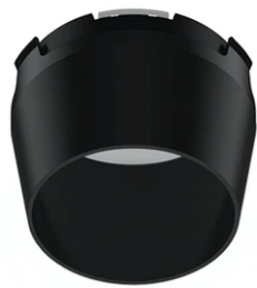
Snoot Shielding Cone 08.9111.00