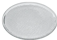
Flood Lens 08.9110.00