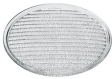
Elliptical Lens 08.9109.00