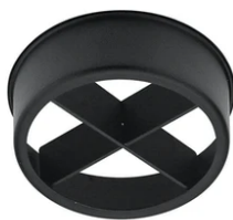
Screening Crosspiece 08.9108.00