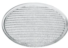
Elliptical Lens 08.9109.00