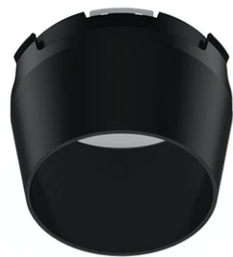
Snoot Shielding Cone 08.9111.00