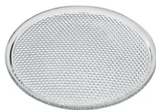
Flood Lens 08.9110.00