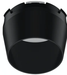
Snoot Shielding Cone 08.9111.00