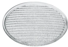
Elliptical Lens 08.9109.00