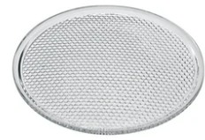
Flood Lens 08.9110.00