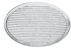
Elliptical Lens 08.9109.00