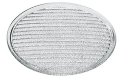
Elliptical Lens 08.9109.00