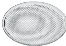
Flood Lens 08.9110.00