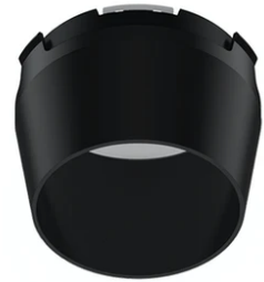
Snoot Shielding Cone 08.9111.00