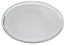
Flood Lens 08.9110.00