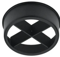
Screening Crosspiece 08.9108.00