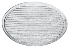
Elliptical Lens 08.9109.00