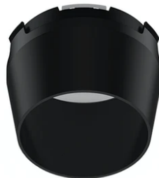
Snoot Shielding Cone 08.9111.00