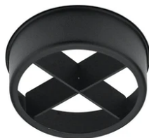
Elliptical Lens 08.9109.00