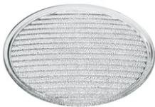
Flood Lens 08.9110.00