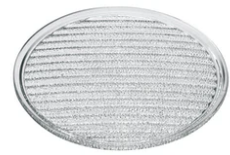
Elliptical Lens 08.9109.00