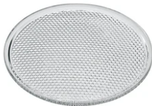
Flood Lens 08.9110.00