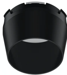
Snoot Shielding Cone 08.9111.00