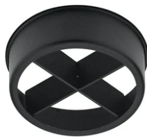
Screening Crosspiece 08.9108.00