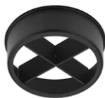
Elliptical lens 08.8431.00