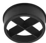
Screening crosspiece 08.8429.00