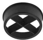
Screening crosspiece 08.8429.00