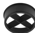
Screening crosspiece 08.8429.00