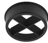
Screening crosspiece 08.8429.00