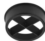
Screening crosspiece 08.8429.00