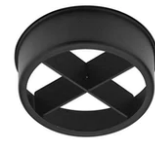
Screening crosspiece 08.8429.00