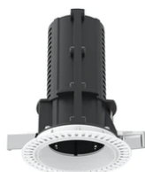
Installation frame NO TRIM 08.8994.14