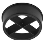
Screening crosspiece 08.8429.00