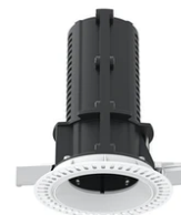
Installation frame NO TRIM 08.8994.30