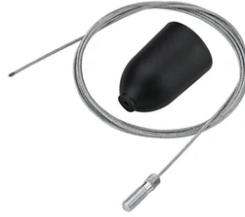
Flexible suspension kit 60.3008.14