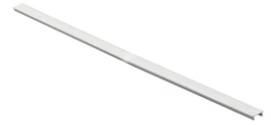
Track cover strip L 3000 mm 60.3090.11