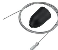
Flexible suspension kit 60.3008.14