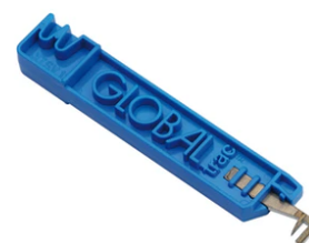
Lead bending key 60.3054