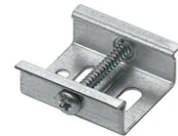
Bracket for fixing track to wall or ceiling 60.3093.29