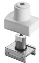
Attachment on track for rod suspension m6 thread 60.3018.11