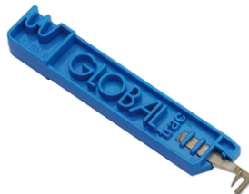
Lead bending key 60.3054