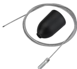
Flexible suspension kit 60.3008.14