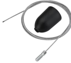
Flexible suspension kit 60.3008.11