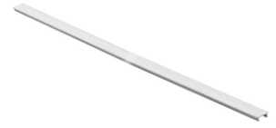
Track cover strip L 3000 mm 60.3090.11