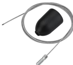
Flexible suspension kit 60.3008.11