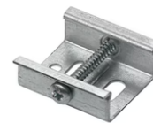
Bracket for fixing track to wall or ceiling 60.3093.29