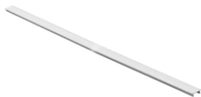
Track cover strip L 3000 mm 60.3090.11