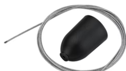
Blind end 60.3016.11