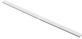
Track cover strip L 3000 mm 60.3090.11