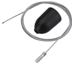
Flexible suspension kit 60.3008.14