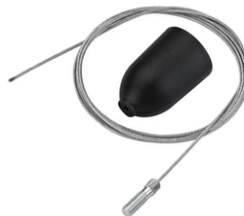
Flexible suspension kit 60.3008.11