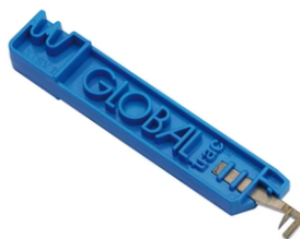
Lead bending key 60.3054