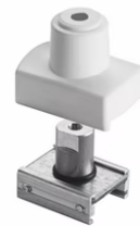
Attachment on track for rod suspension m6 thread 60.3018.11