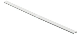
Track cover strip L 3000 mm 60.3090.11