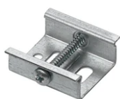
Bracket for fixing track to wall or ceiling 60.3093.29