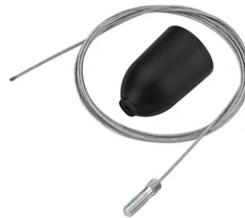
Flexible suspension kit 60.3008.14