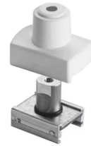
Attachment on track for rod suspension m6 thread 60.3018.11