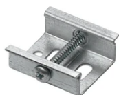
Bracket for fixing track to wall or ceiling 60.3093.29