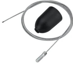
Flexible suspension kit 60.3008.11