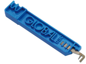
Lead bending key 60.3054