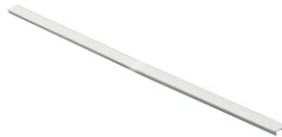
Track cover strip L 3000 mm 60.3090.11