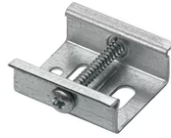
Blind end 60.3016.12