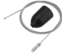
Ceiling fitting with rose 60.3094.11