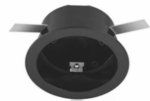
Recessed box for fix-point 60.3022.14