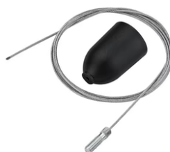
Flexible suspension kit 60.3008.11