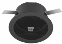
Recessed box for fix-point 60.3022.11