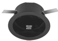
Recessed box for fix-point 60.3022.11