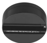
Straight Connector Dali 60.3044.14ADA