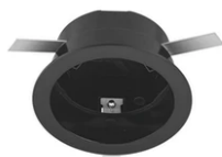
Recessed box for fix-point 60.3022.14