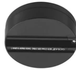
Blind end 60.3016.12