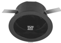
Recessed box for fix-point 60.3022.11