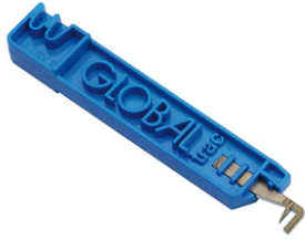
Lead bending key 60.3054