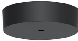
Surface rose 08.8883.14A