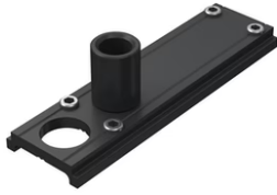
Ceiling fixing kit 08.0616.00