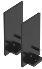
The Tracking Magnet Surface/Suspension Profile End Caps 06.5017.14