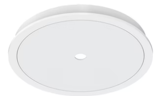
Recessed power supply rose 08.8889.40