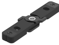
Ceiling fixing kit 08.0615.00