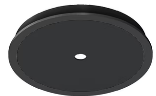
Recessed power supply rose 08.8889.14