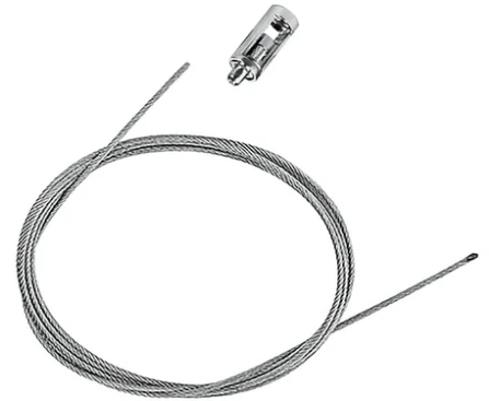
4m suspension steel cable 08.8634.00