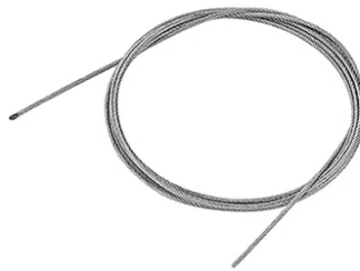
4-pole, 0.75 mm 2 section, 4-meter long, transparent power cable 06.0157.00