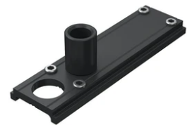
Ceiling fixing kit 08.0616.00