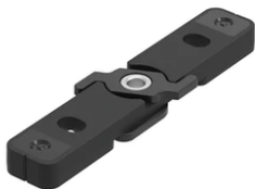
Ceiling fixing kit 08.0615.00