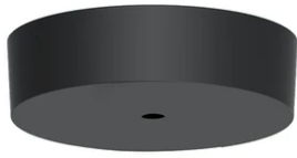
Surface rose 08.8883.40A