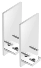
The Tracking Magnet Surface/Suspension Profile End Caps 06.5017.05