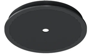
Recessed power supply rose 08.8889.14