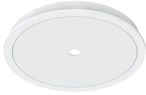
Recessed power supply rose 08.8889.40