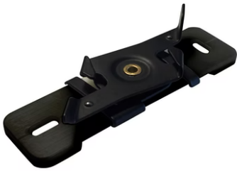
Fixed ceiling kit. 2 unit kit 08.8866.14