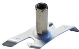
Adjustable ceiling kit. 2 unit kit 08.8867.14