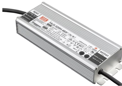
LED Power Supply Source for remote installation. 48V/320W. 100/240 Vac 60.8919