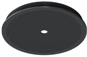
Recessed power supply rose 08.8889.14