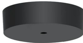
Surface rose 08.8883.14A