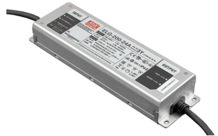
LED power supply source for remote installation in 24V/200W electric control panel. To avoid problems of overload it is recommended to install a power source every 185W. 100/240V. 60.9352