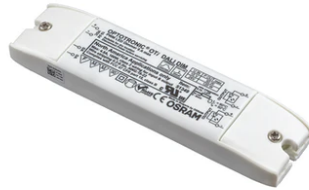
Dimmable DALI control unit with 1 channel for 24V LED modules. Power supply not included 60.8635