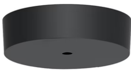
Surface rose 08.8883.40A