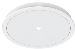
Recessed power supply rose 08.8889.40