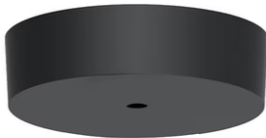
Surface rose 08.8883.14A