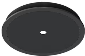
Recessed power supply rose 08.8889.14