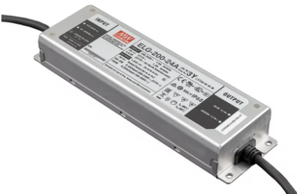
LED power supply source for remote installation in 24V/200W electric control panel. To avoid problems of overload it is recommended to install a power source every 185W. 100/240V. 60.9352