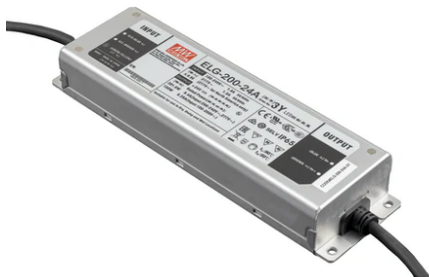
Recessed power supply rose 08.8889.40