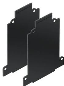
Endcap. 2 unit kit 08.8865.14A