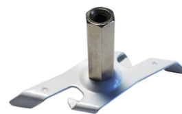
Adjustable ceiling kit. 2 unit kit 08.8867.14