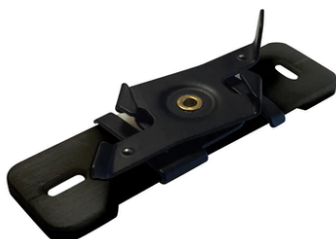
Fixed ceiling kit. 2 unit kit 08.8866.14