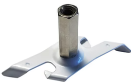
Adjustable ceiling kit. 2 unit kit 08.8867.14