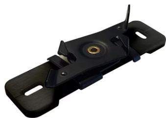
Fixed ceiling kit. 2 unit kit 08.8866.14